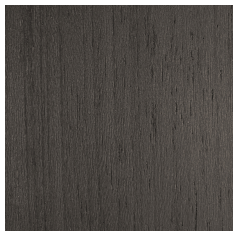
Tay Veneered Dyed Smokey Grey